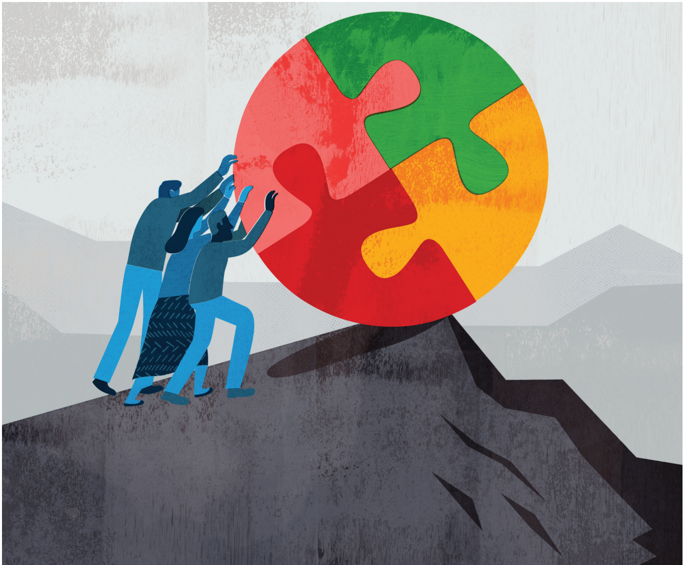
ILLUSTRATIONS BY MITCH BLUNT

juvenile arrests are down 24 percent, with no increase in crime or risk to public safety. 2